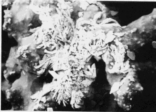
Figure 2. SEM enlargement showing delicate barite crystals covering surface of phosphosiderite. Field of view: 0.13 x 0.16 mm. G. Dunning photo and sample.

The formation of phosphosiderite and strengite was most likely by hydrothermal oxidation of pre-existing phosphate minerals, possibly members of the lazulite-scorzalite series, which are fairly abundant throughout the deposit. Phosphosiderite, for example, has been reported as pseudomorphs after lazulite at Graves Mountain, Georgia, by Barwood and Hajek (1979). Since both phosphosiderite and strengite have been found in very limited quantities, the conditions for their formation appear to have been limited and localized.