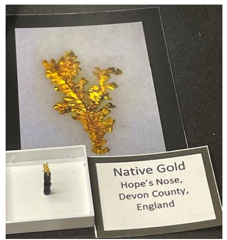
One of 24 specimens in the micromount case.