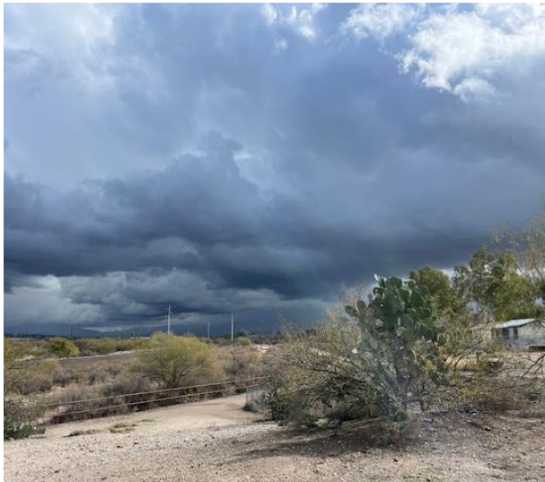
Tucson weather 2024, especially during the last 10 days of the shows.