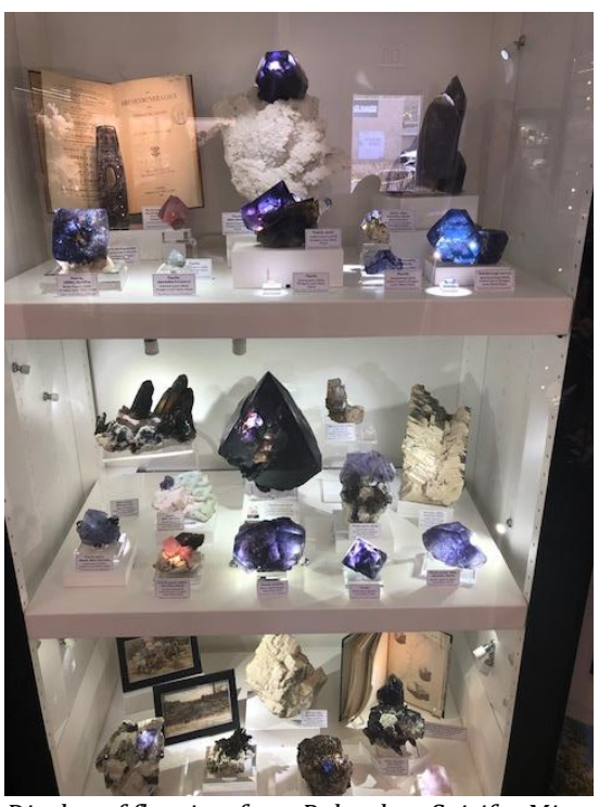
Display of fluorites from Poland, at Spirifer Minerals (not for sale).

May 24-26, El Dorado CA Northern CA Mineralogical Association Annual Micromineral Conference El Dorado Community Hall From 2 pm Friday to noon Sunday. Schedule and registration available soon.